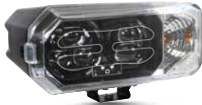
LED Snow Plow Headlight