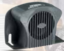
87dB | 97dB | 107dB