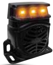
87dB | 97dB | 107dB