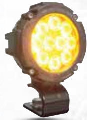
XWL-800 Flashing Amber Warning Light