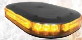
LED Strobe Beacon