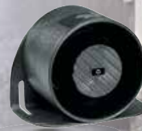
Self-Adjusting 82dB - 107dB 87dB - 112dB

Heavy duty LED work lights, lighting and electronic solutions for mining, construction, forestry, military or off-road.