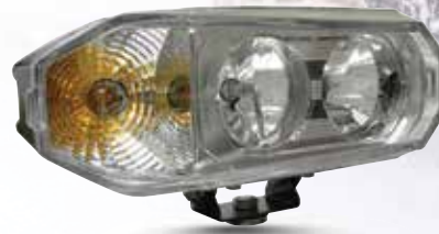
Halogen Snow Plow Headlight