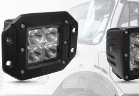
Flush Mount LED 1080 Lumens